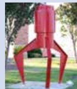
14. Download Artist: Timothy Cassidy Sell Price: $7,500 Sponsor: Mankato Area Foundation