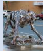
10. It's Mine! Artist: Bruce E. Morness Sell Price: $25,000 Sponsor: ISG