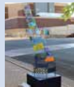
8. Treasure Tower Artist: Gail Katz-James Sell Price: $6,800 Sponsor: Downs Food Group