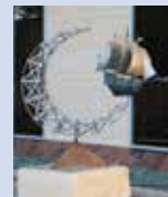
4. Song of the Flying Dutchman Artist: Kyle Fokken Sell Price: $10,000 Sponsor: Wells Fargo