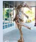
19. Ice Flow Artist: Judd Nelson Sell Price: $10,750 Sponsor: Mankato Figure Skating Club